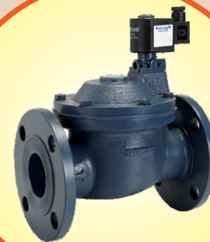
9160 / 9162 K