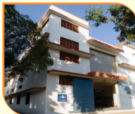
Office & Works Unit -IV