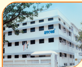
Office & Works Unit -II