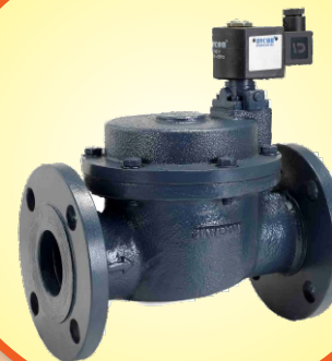
9160 / 9162 P