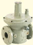
RG TYPE REGULATOR

Complete Gas Train for inlet pressure upto 4 bar, outlet pressure from 5 to 350 milli bar. Product includes - Filters, Safety shut off Valves, Regulators, Safety Relief Valves, 2-Position Solenoid Valves Fast Closing, Slow Opening, Gas Ratio Control and Zero Gas Governors, Hundreds of Gas Train in field.