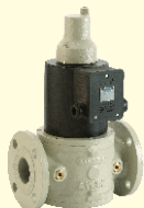
SG TYPE SOLENOID VALVE